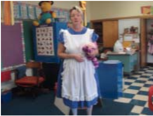
Alice in Wonderland Zahrobsky