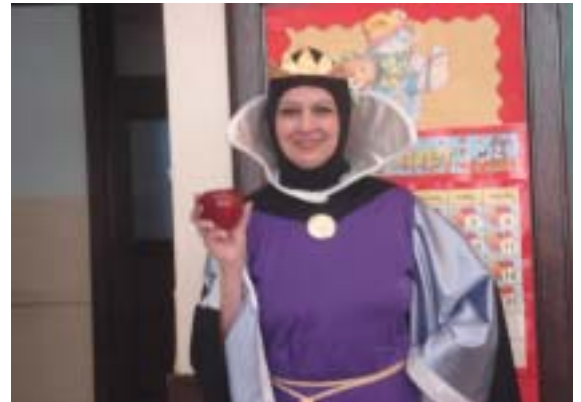
Wicked Queen Ceasario