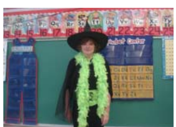
Wicked Witch Laugello