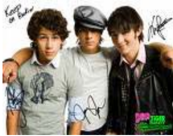
The Jonas Brothers