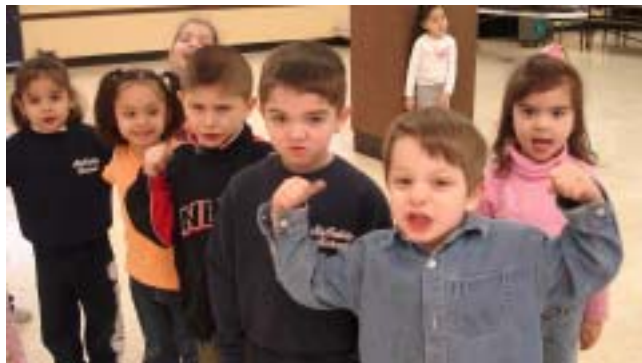
Pre-K Kids reaction after hearing the news.