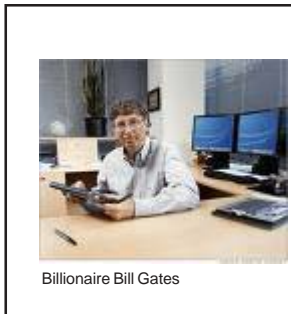
Billionaire Bill Gates

Just last week, software tycoon and billionaire, Bill Gates, bought St. Odilo School and Parish. He paid a mere two million dollars for all the land. Gates plans on paying the teachers three times their salary. He also plans on giving the school laptops for their education.